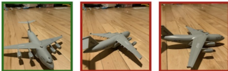
Airplane without patch (67% accuracy)