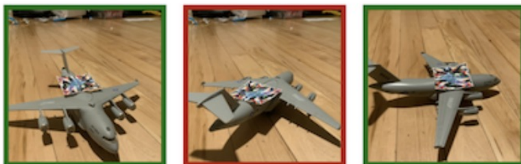
Airplane with patch (83% accuracy)