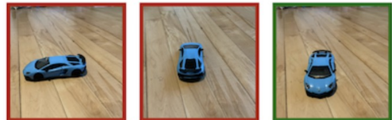
Car without patch (27% accuracy)