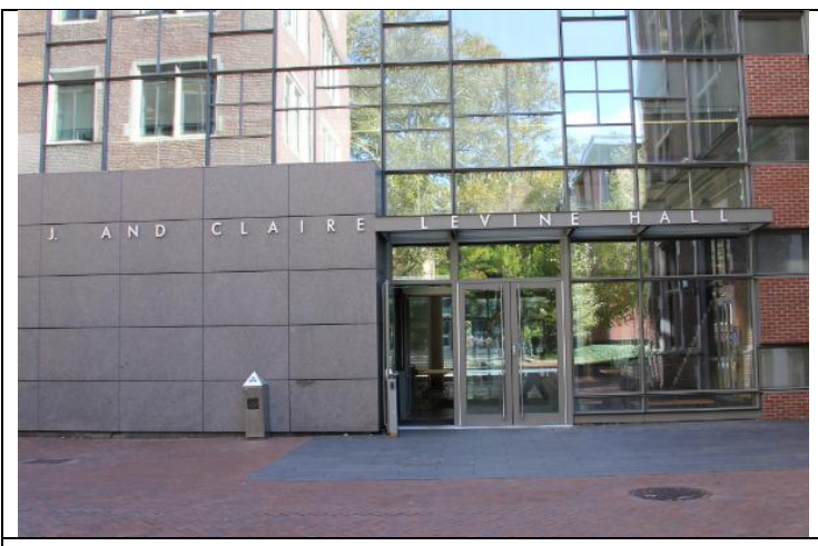
STEP 1: Enter Levine Hall through the double doors on the west side of the building, coming down the brick sidewalk from 34<sup>th</sup> Street (just south of Walnut Street).