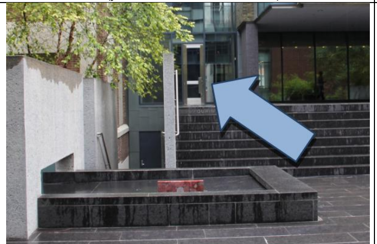
STEP 3: Head straight through and up the steps of Quain Courtyard. There is a single door on the left – head through it and you will be in a stairwell.