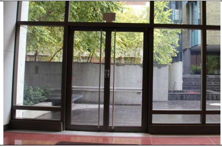
STEP 2: Come through the lobby of Levine Hall, and head out the double doors into Quain Courtyard, an outdoor area.